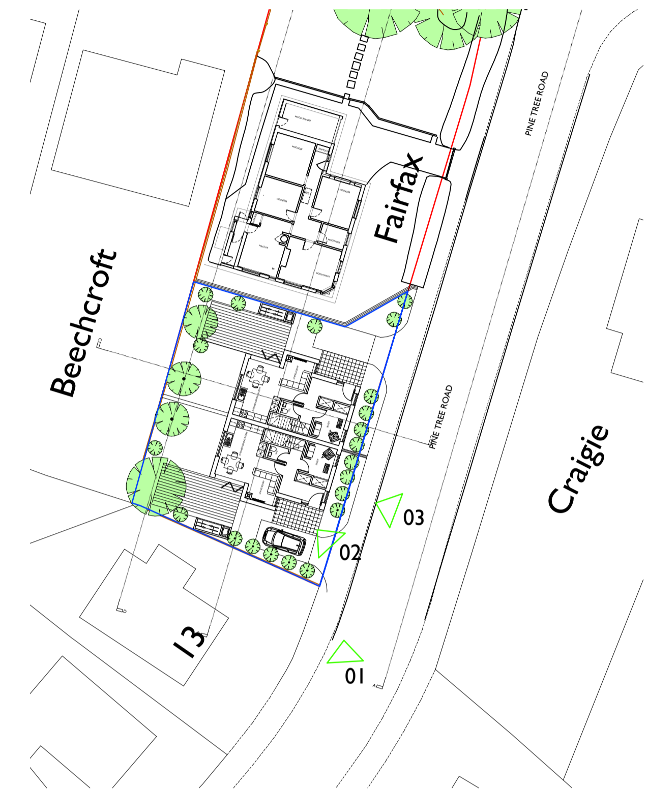
+OP ORIENTATION PLAN